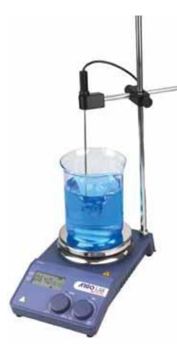
Stirrer M2-D Pro with adjustable stand and PT 1000 probe